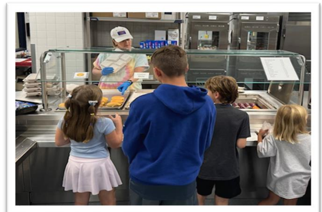
Several 8 th Grade Leadworthy students are assisting our Kindergarten students during lunches for their internship.